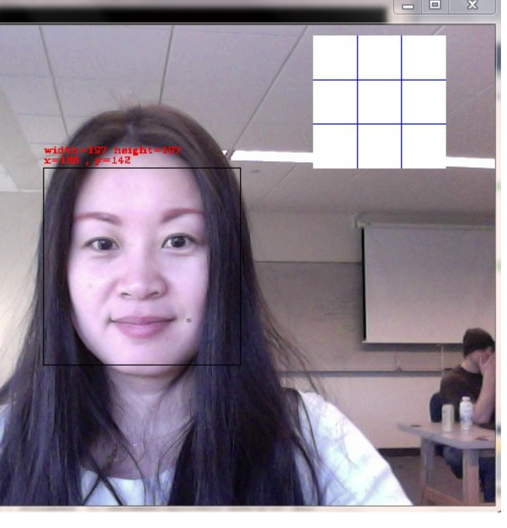
1. Face detection